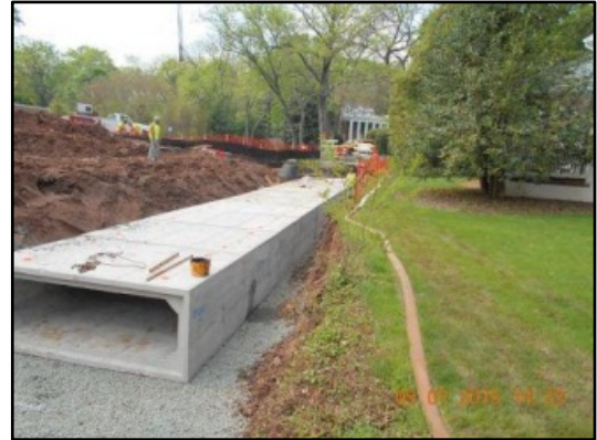
Upper Flat Branch Interceptor Project

Planning and funding continues to replace sections of gravity sewer main along the Upper Flat Branch Interceptor.