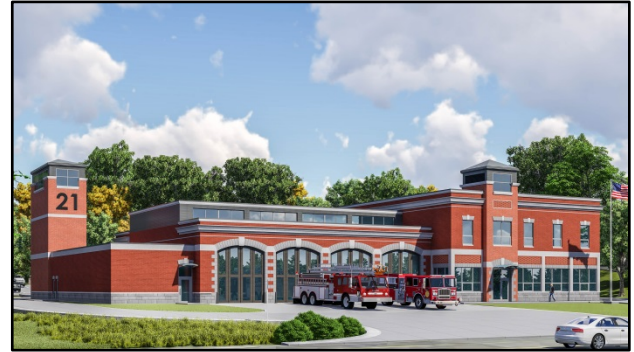
Fire & Rescue Station #21

Begin construction of the new combined fire and rescue station.