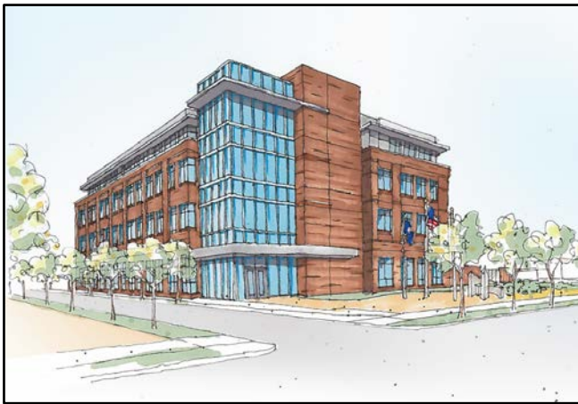
Public Safety Facility

Site and building design for the Public Safety Facility at 9608 Grant Avenue is underway. The facility will include Police Headquarters, consolidated public safety logistics, 911 Center, Emergency Operations Center, Fire & Rescue Administration, and the IT Department.