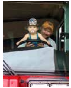
Right: Father and son check out the GMVRS open house.