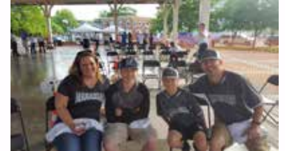
Above: learning Hands Only CPR - 450 people participated.